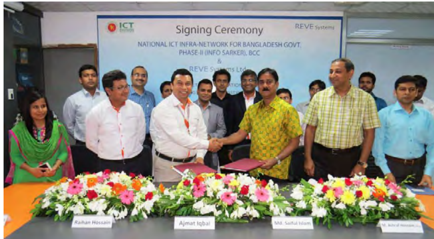
REVE Systems and INFO SARKER projects signing ceremony